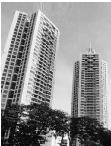
Sharp correction Oberoi Realty vs sectoral benchmark

Analysts led by Sumit Kumar of the brokerage point out that the Sky City project has witnessed sharp uptick in pricing over the last two quarters aided by opening of the retail mall and the upcoming